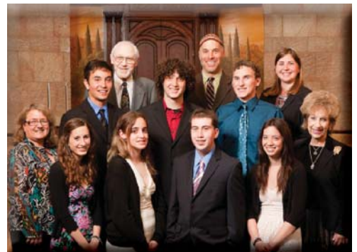
2010 Post Confirmation Graduates

Submissions for the next Temple e-Talk are due by August 5th to Bonni.